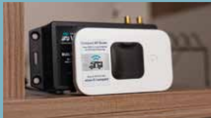
Built in Wi-Fi