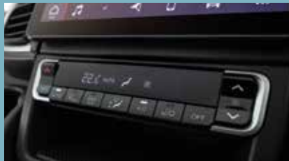
Automatic cab air conditioning