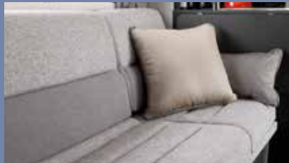
Upgraded luxury upholstery