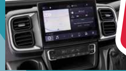
New 10" touchscreen Screen, DAB, Apple Carplay™ / Android Auto™ and motorhome sat nav with steering wheel controls