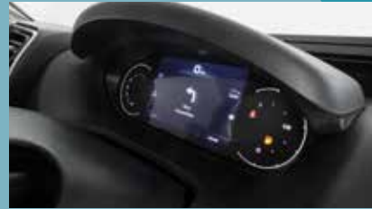
Full digital instrument cluster with high level dash