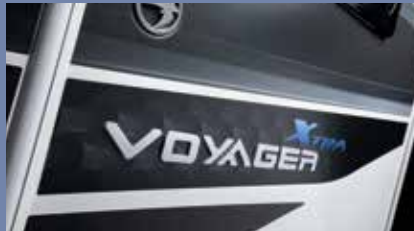
Unique exterior graphics