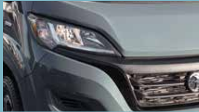
Bi-Xenon headlights with LED daytime running lights