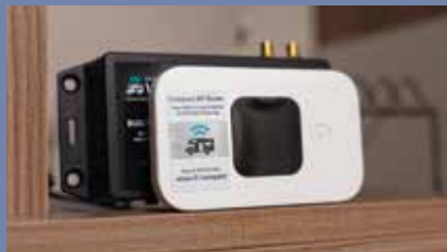
Built in Wi-Fi