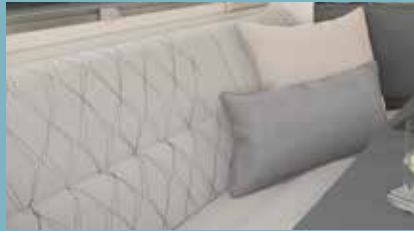
Luxury Ultra-Leather® easy clean soft furnishings